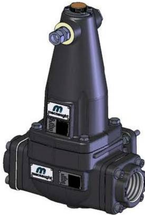
(a) Macnaught Model MAE21-CA1 Gas Extractor With Integral Filter/Strainer