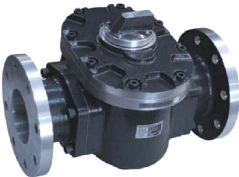
(c) Model WM100 (or M100) With Flange Ports