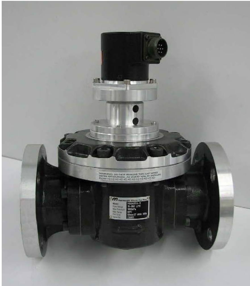
Macnaught Model M50 Flowmeter with a Hontko HPN-6A Series Rotary Encoder Pulser