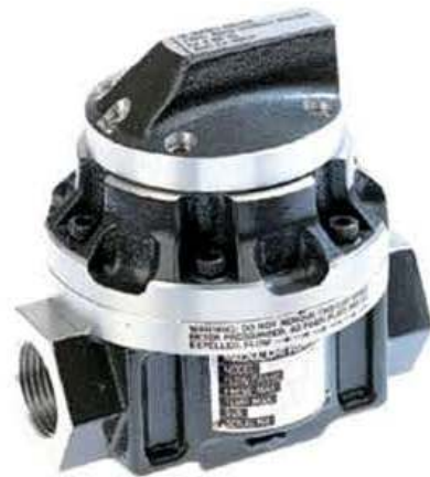
(b) Model WM10 (or M10) With Threaded Ports