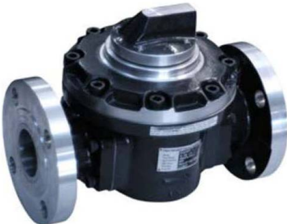
(b) Macnaught Model WM50ARP-3E Flowmeter With Integral Pulsar